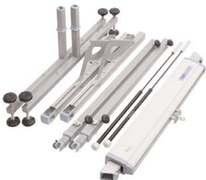
• Compact and transportable