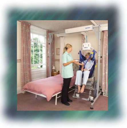
• Ease of transfer