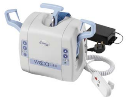
• Wispa Lite portable hoist option